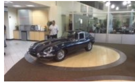
OUR FIRST CLUB EVENT FORT MYERS JAGUAR