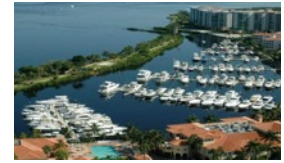
OUR FIRST CONCOURS GULF HARBOUR