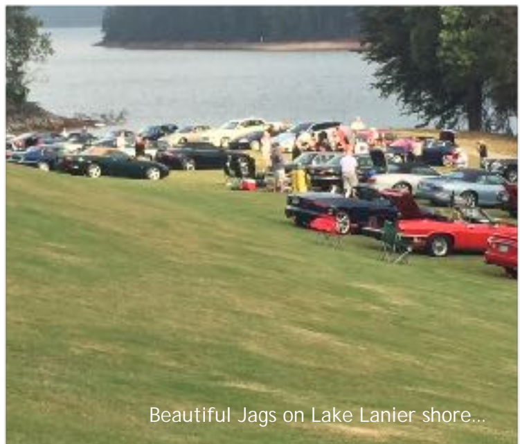
Beautiful Jags on Lake Lanier shore...