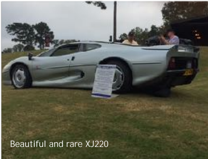
Beautiful and rare XJ220

On Friday, October 13, the International Festival Concours was under way. The cars started entering the field at 7:00 am, overlooking beautiful countryside and lakes. Judging began at 10:30, all cars were completed being judged by 3:00 pm. I was asked to judge, and I will say, it was the easiest, most fun and delightful judging of cars of my judging experience.