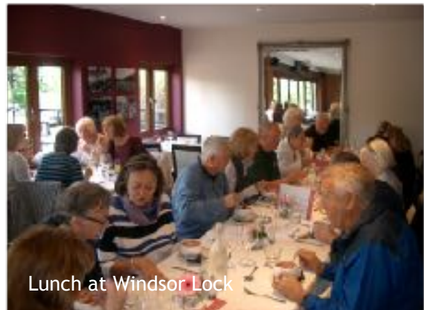
Lunch at Windsor Lock

This was a perfect end to a great tour for the following day we were all taken to London enjoying traffic Jam on the M4 /M25 intersection that is now all too familiar in the UK followed by another traffic snarl in London but we all got there in the end thanks to Linda's guides and drivers. (More on page 11)