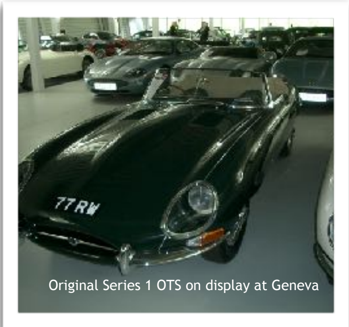
Original Series 1 OTS on display at Geneva