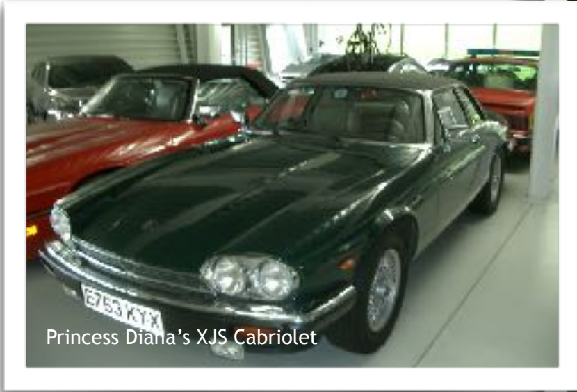
Princess Diana's XJS Cabriolet