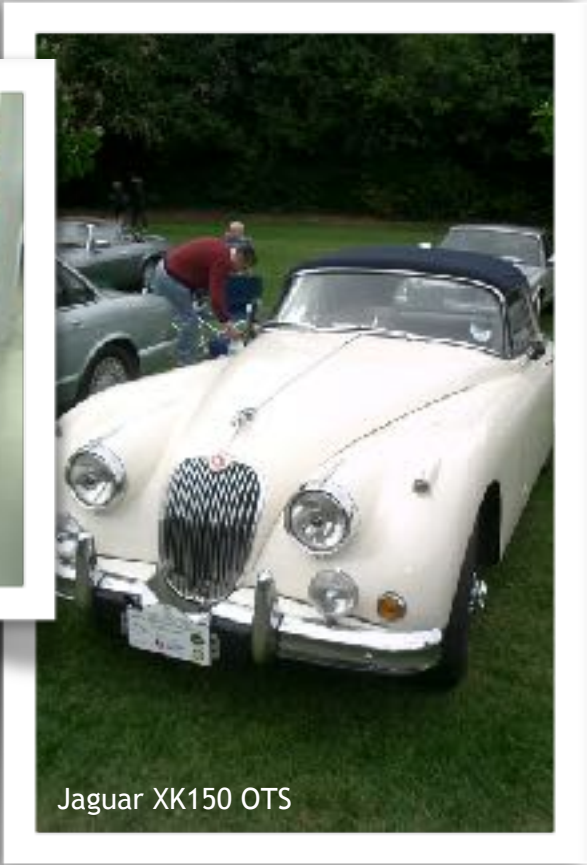
Jaguar XK150 OTS