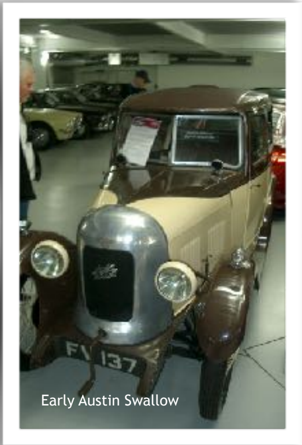
Early Austin Swallow