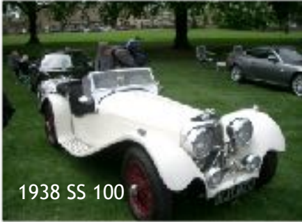
1938 SS 100